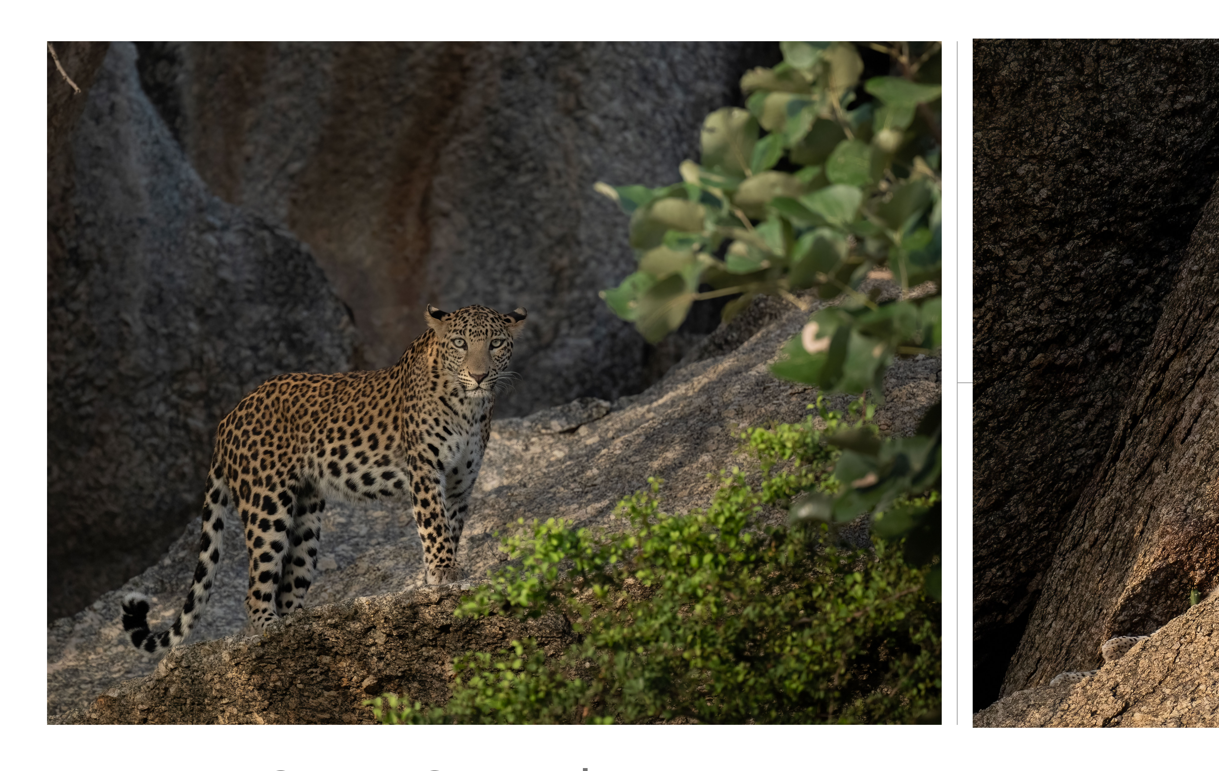
JAWAI: LEOPARD SAFARI | FEBRUARY 2024